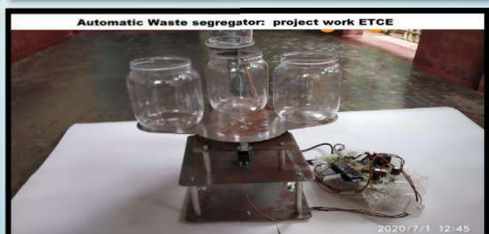
Automatic Waste segregator: project work ETCE