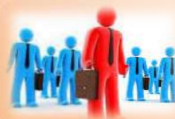
Training & Placement Cell

From 2nd June 2020, the 4th semester students has started one month Online Industrial Training in NIELIT, Agartala. Training topics are- 1. MATLAB, 2. Cyber Forensic 3. CISCO Routing and Switching Essentials 4. Web Designing and 5. Auto CAD. In addition, during lockdown period Online work from Home job interview was arranged for students by Training & Placement Cell. After online interview sessions, 15 of our students got selected for such job in BankZone.