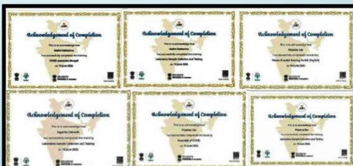
MLT Students Registered in I-GOT & Completed