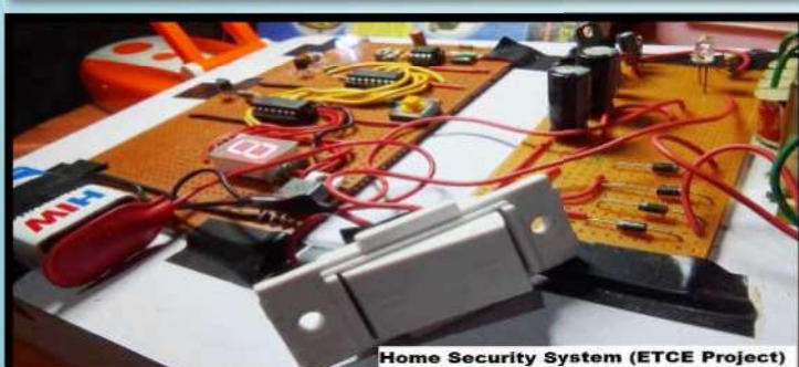
Home Security System (ETCE Project)