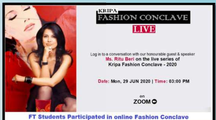
FT Students Participated in online Fashion Conclave