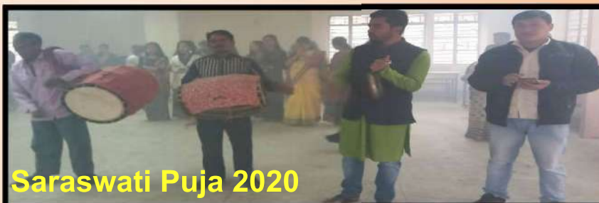
Saraswati Puja 2020