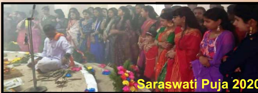
Saraswati Puja 2020