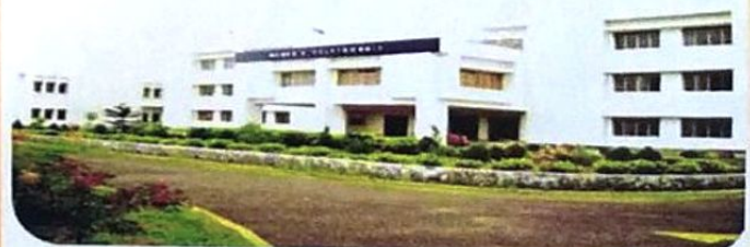
A Virtual Tour